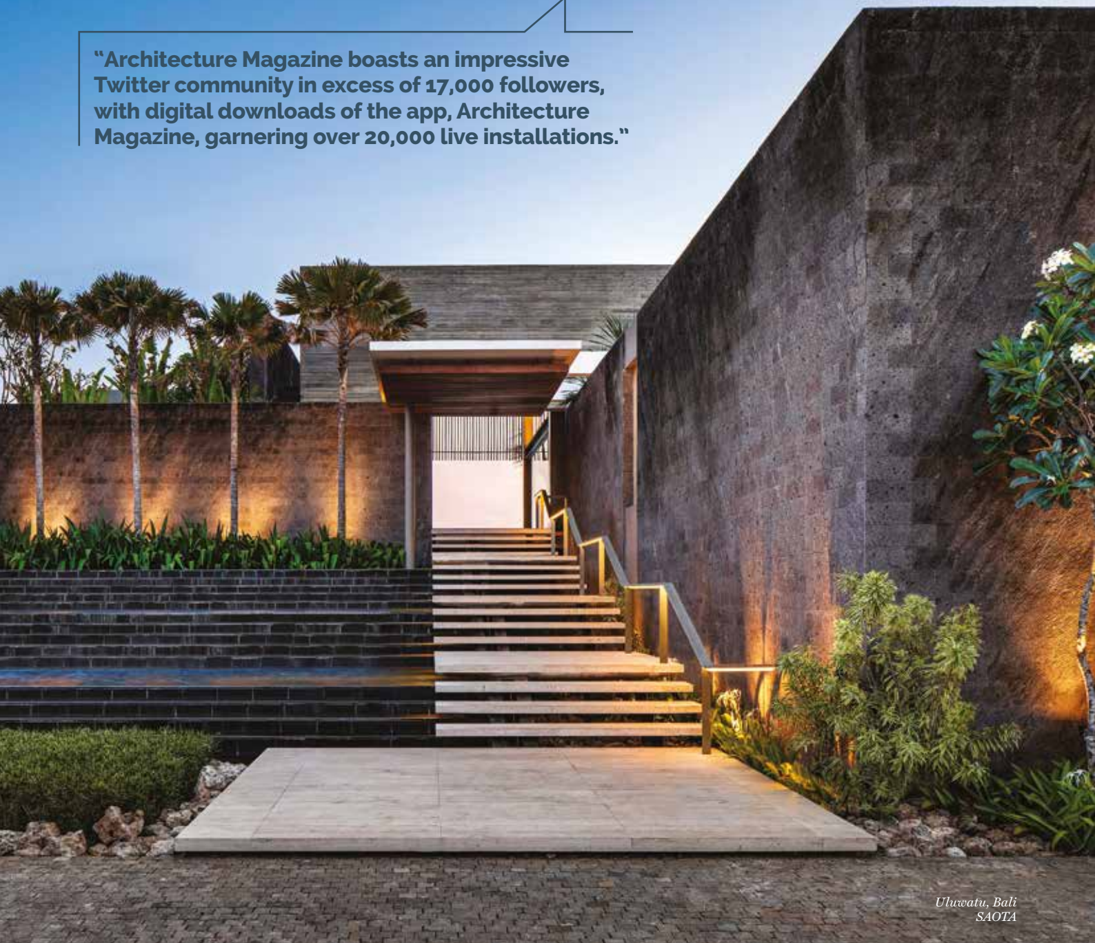
Uluwatu, Bali SAOTA

“Architecture Magazine boasts an impressive Twitter community in excess of 17,000 followers, with digital downloads of the app, Architecture Magazine, garnering over 20,000 live installations.”